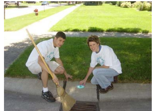
Volunteers mark storm drains with "No Polluting, Drains to Waterways" permanent decals. These decals promote the link between streets, storm water run-off and water pollution. Place markers in your neighborhood by contacting the Health Dept. at 810.987.5306 or stormwater@stclaircounty.org

The purpose of River Day is to celebrate, learn about, and enhance our abundant water resources through recreation, education, and stewardship activities. Whether you like to walk, fish, plant, paddle or play, there's something for everyone during River Day! How can you get involved? Sponsor or promote events, recruit volunteers, or simply come out to enjoy the day! Request a River Day Event Guide to learn more about each event (see side bar).