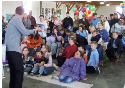
DTE Energy sponsored an educational and entertaining Enviro-Magic show.

On April 15-16, the St. Clair County Environmental Education Network celebrated its 3 rd Annual Earth Fair at Goodells County Park. The event is a grass-roots effort to educate people who want to promote a cleaner, healthier world for themselves and future generations. There were informational booths, hands-on activities, live animals, wagon rides, natural products, plants, and art for sale, performers, hybrid vehicles, and more! Earth Fair is held every year in conjunction with the St. Clair Conservation District's tree sale.