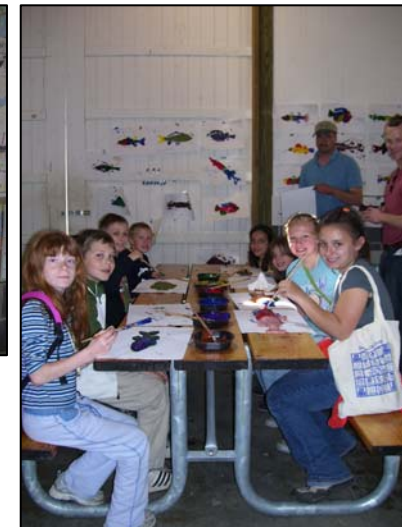
Students show off their artistic side by creating painted prints of Michigan fish.