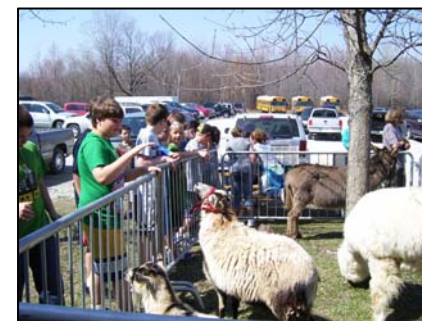
Kids had fun interacting with the rabbits, llamas, alpacas, goats, turtles, birds and snakes.