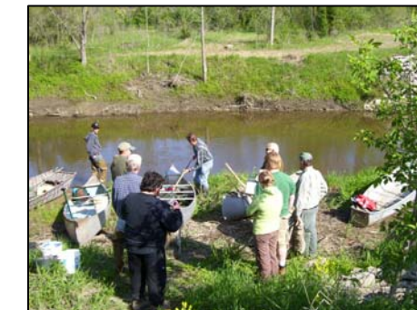
Volunteers congregate with their canoes on the banks of Mill Creek ready to embark on the river cleanup.

And the 19 th annual St. John's Marsh cleanup in Clay Township removed three compacted cubic yards of trash.