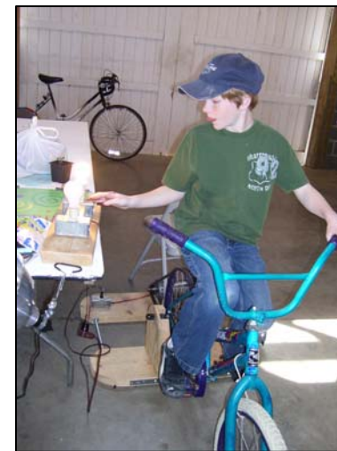
A boy takes his turn at riding a bike which generates electricity to the light bulb.