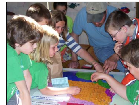
Gearing Elementary students take turns placing a pin on the map to identify their watershed.