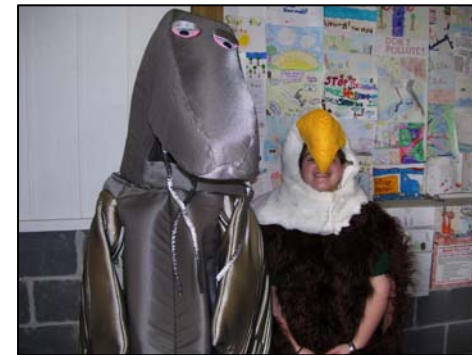
Our friends, the sturgeon and the eagle, paid us a friendly visit.