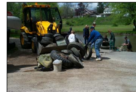
At the end of the Mill Creek cleanup in Yale City Park, volunteers roll tires out of their canoes and into a tractor waiting to dispose of them.

On Mill Creek, six canoes floated down a 3-mile stretch of river and pulled out a dumpster-worth full of trash. In Port Huron Township, students from Central, Chippewa and Memphis middle schools helped remove litter from Stocks Creek. Volunteers with Algonac State Park used heavy equipment to pull out all the debris they found in the Marine City Drain. On the Pine River volunteers worked long and hard to clear the river of log jams and other debris to make it navigable for canoeing. The scenic Belle River in Columbus Township had volunteers pulling out furniture of all shapes and sizes.