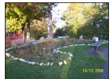
The Lexington Garden Club's rain garden absorbs runoff from the road, filters pollutants, and improves water quality.

Order deadline is June 11 th . Request an order form at (810) 987-5306 or riverday@stclaircounty.org .