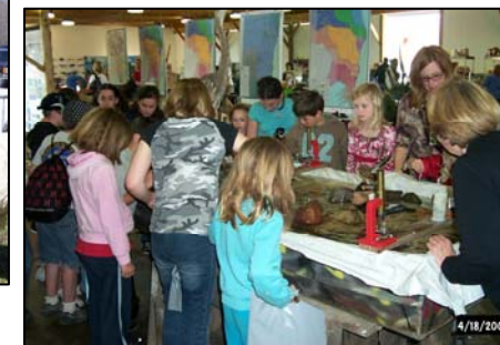
Students crowd around a boat filled with aquatic organisms and a chance to view them up close under a microscope.

Join us in April for Earth Fair 2009 at Goodells County Park, the only place to celebrate Earth Day in St. Clair County.